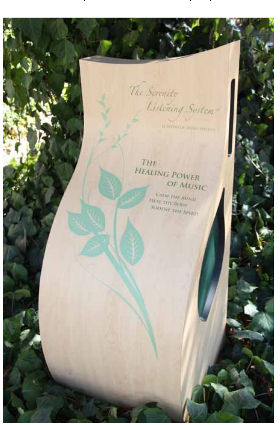
Copyright © 2012 by Aesthetic Audio Systems