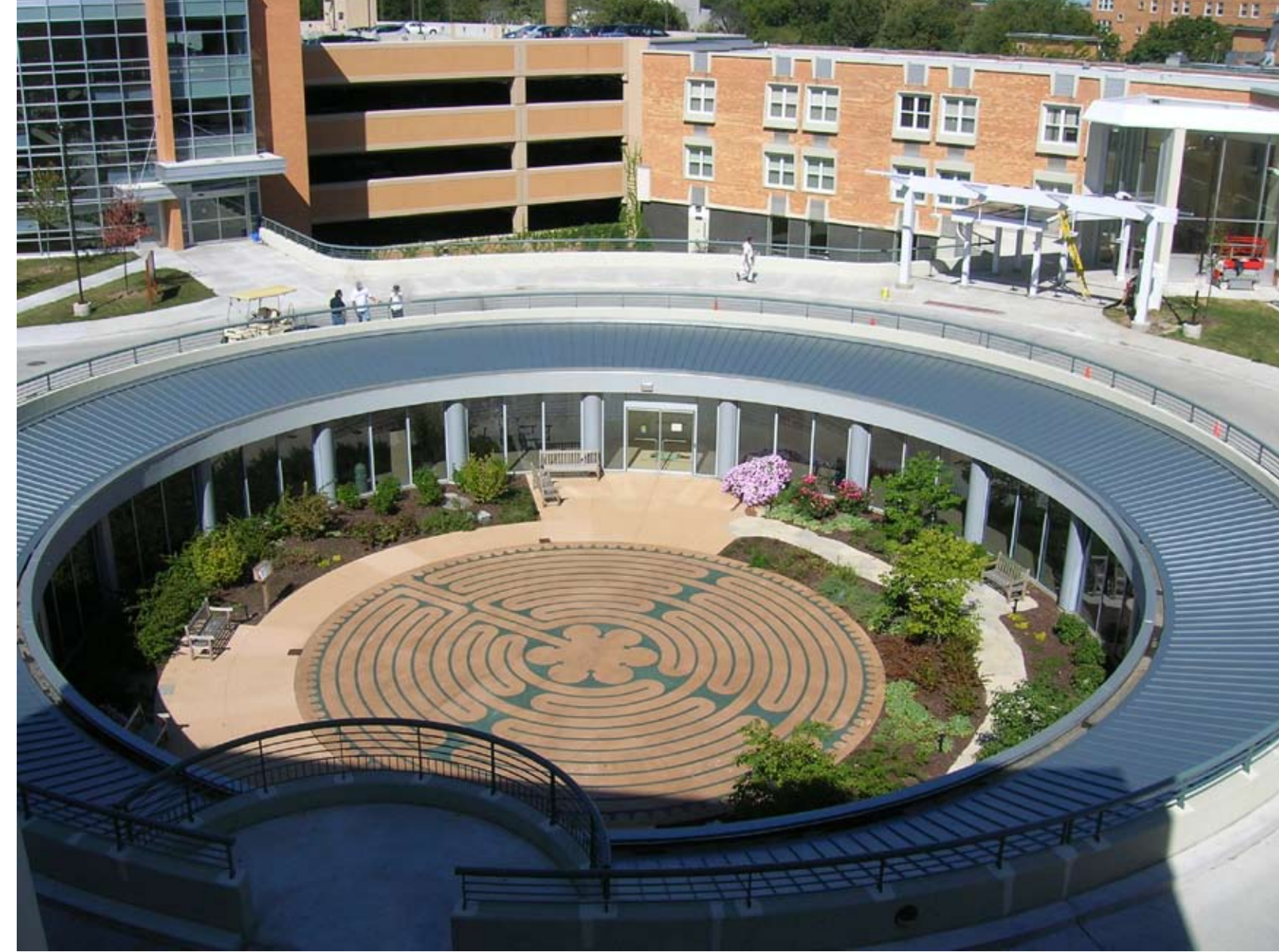
Labyrinth: Invigorate and refresh the minds of patients, visitors, caregivers and staff.