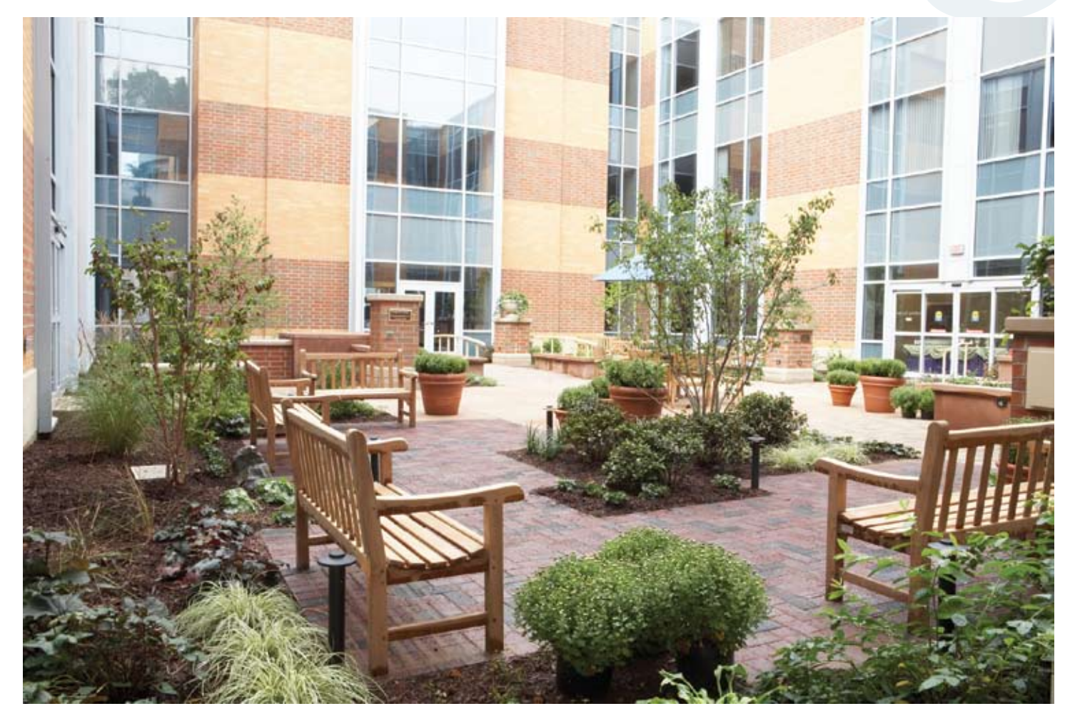
Enabling Garden: Reduce stress and anxiety and encourage "sound health."

During construction of Marianjoy Rehabilitation Hospital's newest building, Aesthetic Audio Systems was engaged to conduct an acoustic assessment of their planned space (using architectural plans), as well as their existing rehabilitation hospital facilities. The labyrinth, while attractive and wheelchair accessible, was not as 'inviting' as they wished it to be. The utilization of the labyrinth was limited to those who were directed there and not by those left to their own inclination.