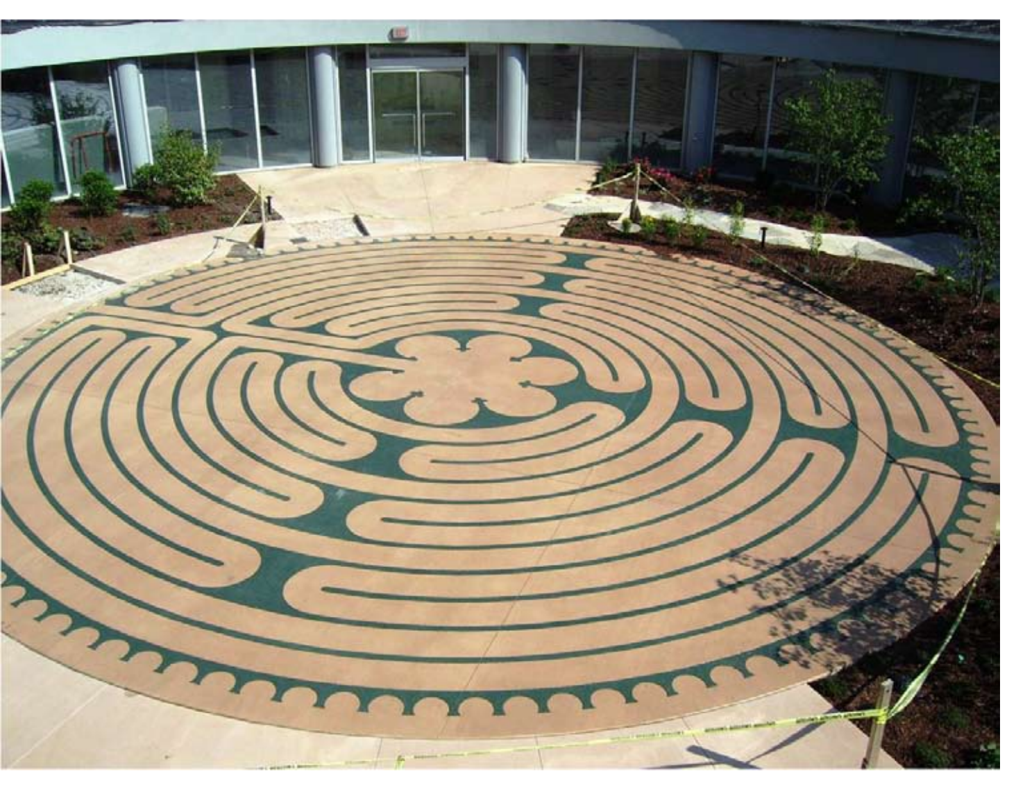
Full-size replica of the Chartres Cathedral labyrinth, surrounded by landscaping with strategically placed rock speakers.

We hypothesized that developing environmentally tuned music for both the adjoining hallways and the labyrinth would create unity between the inside and outside as well as a more pleasant environment for people to sit and have greater exposure to the labyrinth, its signage and usage.